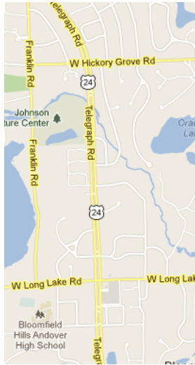
Figure 2 - Test site map

display also shows a down counter with the number of seconds to signal change from green to amber/red.